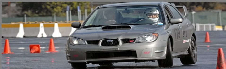
Father & Son teams up to support childhood cancer research, having fun with a Sunday afternoon drive!

On a voluntary basis Competitors are encouraged to donate $1.00 per cone penalty (Kitty will be placed in Raffle/Registration area).